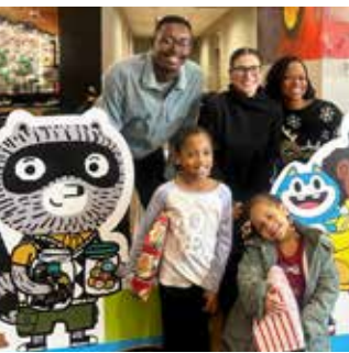
Pg. 3 Foundation Donors Help Keep Their Favorite Programs on the Air