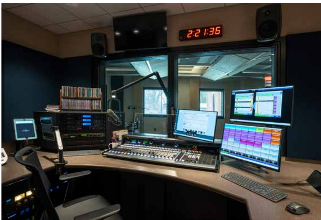
An estimated 70,000 individuals in Southwest Ohio and around the world listen to WYSO each week on the radio and through its digital stream.