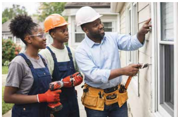
Greater Edgemont Community Coalition

Greater Dayton Union Cooperative ($25,000) to strengthen Gem City Market's Long-Term Sustainability Strategy and community engagement