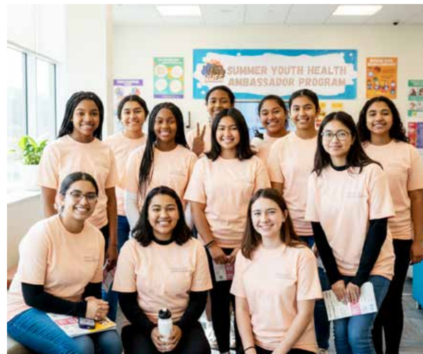
HUES Women's Health Advocacy Institute