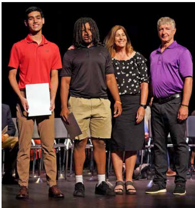
The Play4Payne Scholarship Fund