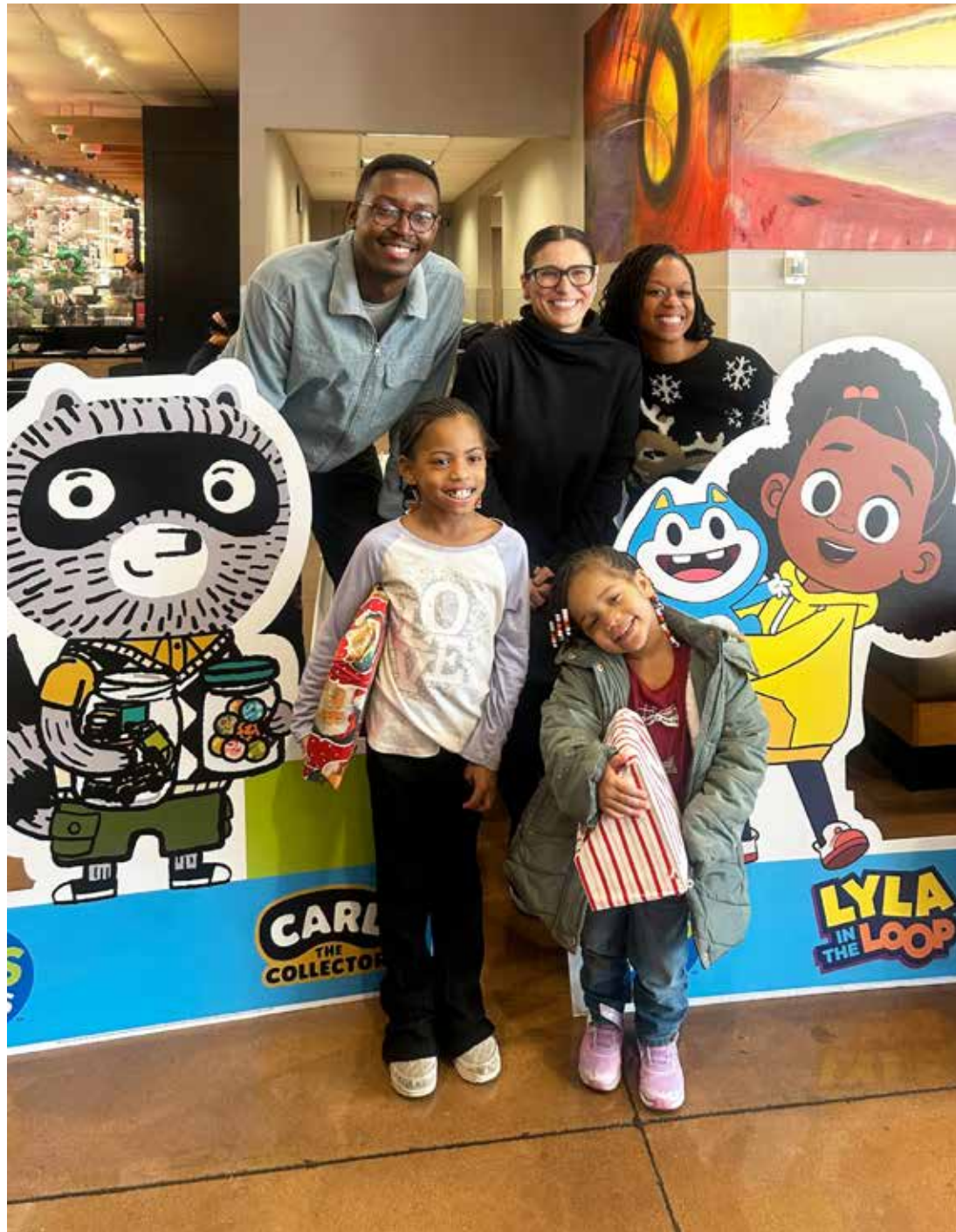
ThinkTV, which carries local PBS children’s programming, provides free, high-quality educational programming that helps millions of children develop literacy and STEM skills.

Gifts like these help public media organizations allocate funding where it’s most needed and enable them to provide informative and educational programming to connect individuals in the community.