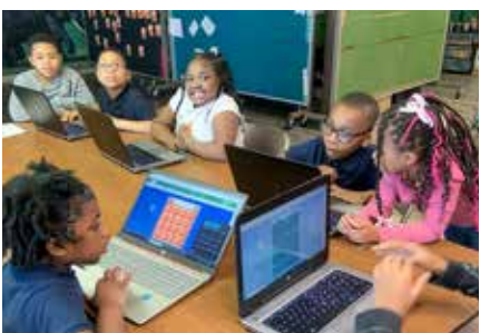
Abundant Life Christ Centered Ministries

The Foundation's discretionary and Greenlight Grants programs are made possible by donors who have provided unrestricted or lightly restricted funds. These funds enable the Foundation to act on opportunities for the community and address pressing needs throughout the region.