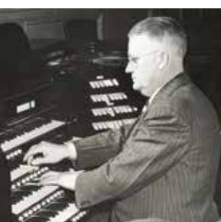
Pg. 8 From Orchestrating Life's Milestones to Helping Students Reach Their Own

Every so often, an opportunity arrives that invites us to pause and imagine what is truly possible for our community. Recently, The Dayton Foundation partnered with Philanthropy Ohio and several other community foundations across the state in a research effort that offers a powerful glimpse into the future of generosity in Greater Dayton. The findings are nothing short of extraordinary.