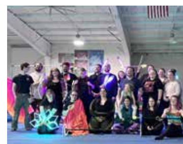
Five Rivers Flow Arts

Five Rivers Flow Arts ($1,000) to purchase props for artists and performers