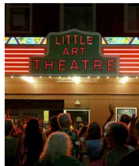
Little Art Theatre Association

The Learning Tree Farm, Inc. ($4,740) to install a comprehensive security camera system