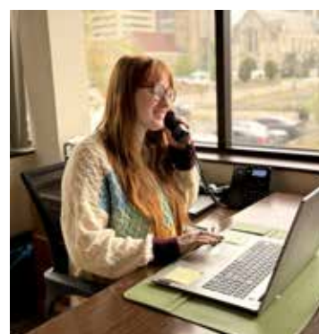
Artemis Center for Alternatives to Domestic Violence

Artemis Center for Alternatives to Domestic Violence ($5,599) to purchase a donor and constituent relationship management system