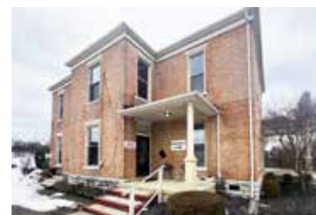
TCN Behavioral Health Services

Spectrum New Beginnings ($20,000) to strengthen coordinated support for maternal and infant health in under-resourced communities