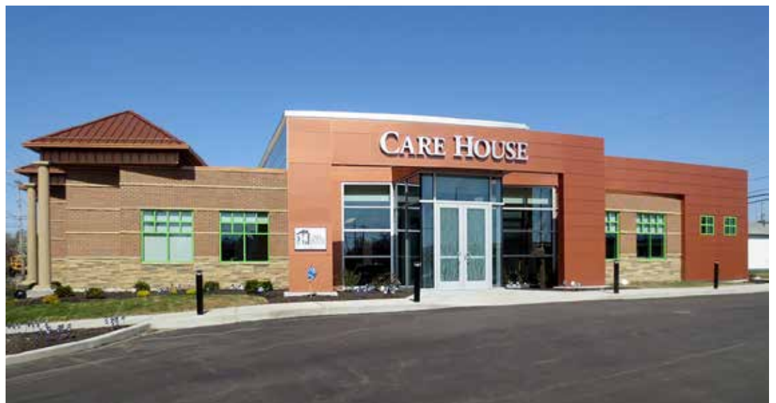
CARE House offers support and hope for children and families affected by abuse in the community, serving as a role model for best practices for children’s advocacy centers nationwide.