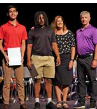
Pg. 5 New Endowment Funds