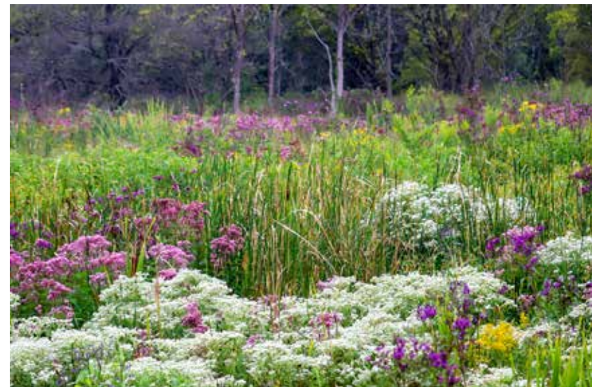
Beaver Creek Wetlands Association

Artemis Center for Alternatives to Domestic Violence ($5,599) to purchase a donor and constituent relationship management system