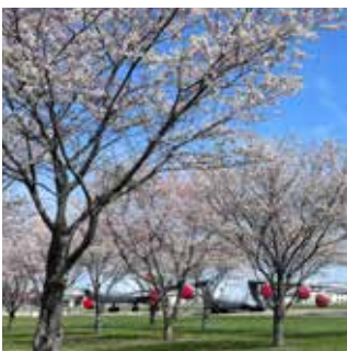
Pg. 4 Donor's Gratitude Inspires Beauty Throughout Greater Dayton